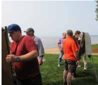
Groups work beachside on direct and indirect impacts/cost of project loss at the beach maximizing on the stellar weather.