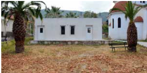
The new doctor's office in beautiful Olympia, Greece.

Redpath Greece P.C. has generously contributed to the cost of construction of a doctor's office in Olympia. The donation provided the windows and the doors for the building.