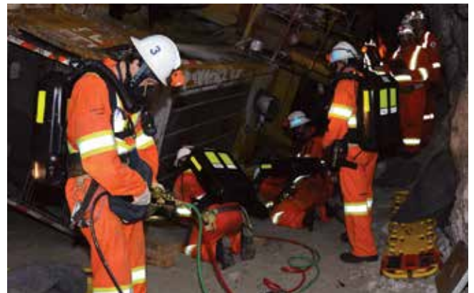
Using lift bags for recovery.