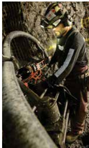
Pogo Project, Alaska