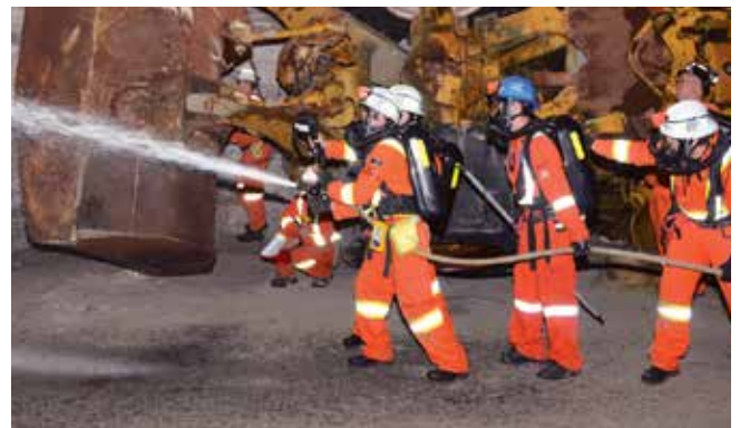
Participants firefighting in the competition.