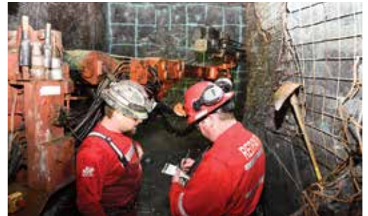
Kensington Mine, Alaska