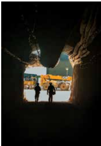
Stillwater Mine, Montana