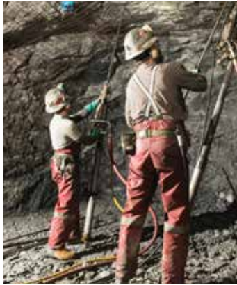
Pogo Project, Alaska