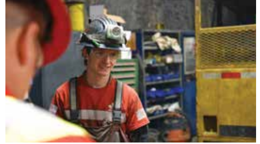
Golden Sunlight Mine, Montana