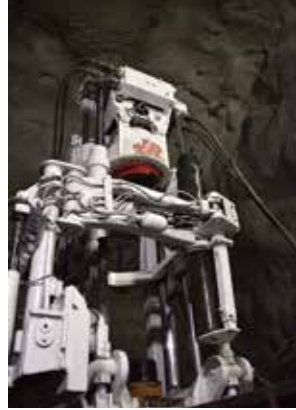
Barrick Goldstrike Mine, Nevada