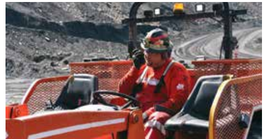
Barrick Goldstrike Mine, Nevada