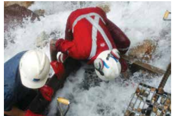
The crew clearing the debris from the catchment areas.