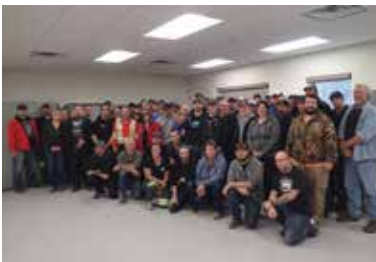
The Musselwhite crew proudly celebrated 1 year with no Lost Time Injuries as of August 15!