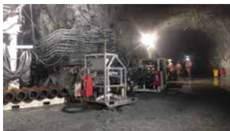
The Redbore 60 stands proudly in Chile.