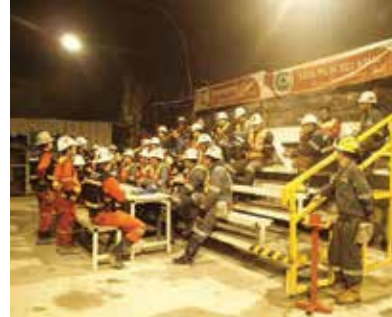
A GBC construction crew underground safety huddle.

Each draw point consists of a steel lintel set weighing over 4,000kg which is concreted in place and designed to control muck flow from the draw point. High strength concrete wear bumpers which lead into the lintel set from the access provide a protective barrier to reduce the undercutting of entry pillars. High strength concrete floors in the draw point area and panel access help to reduce maintenance costs and increase the reliability of the future mine gem operation.