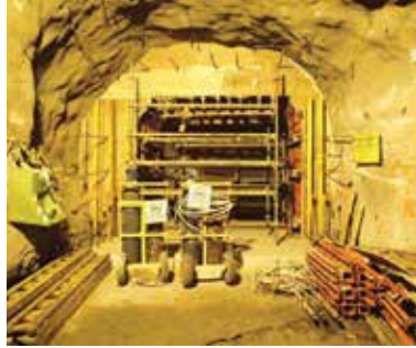
A draw point that has been formed and is ready for concrete.