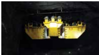
Musselwhite achieved a major milestone on Sept 22 by collaring the 5.5 m diameter reaming head of the Material Handling Shaft. The lateral development and construction crews worked with the Raisebore team safely and successfully!