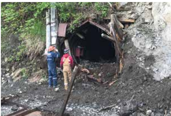
The portal shown before the start of work.