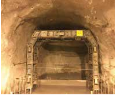
New steel draw point lintel sets.

The Grasberg Block Cave Mine (GBC) construction project in Indonesia was off to a great start in July. The project to construct draw points and draw point accesses will see over 2400 of such draw points constructed during the next few years.