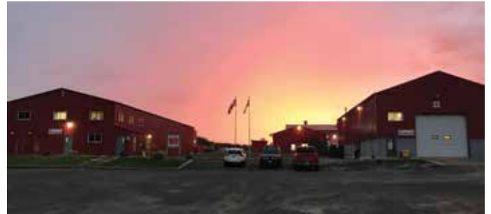
An early morning glimpse at the sun peeking it's head over the 4560 shops in North Bay, Ontario.