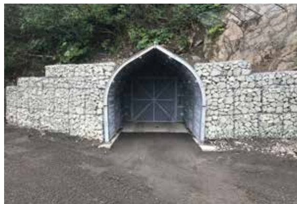
The portal shown after the completion of work.