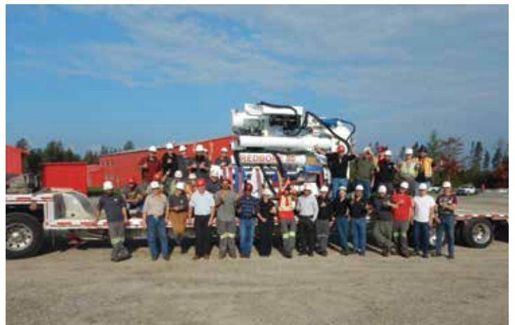
North Bay, Ontario: A multi-departmental crew stand in front of the loaded Redbore 80 which is headed to Redpath Chilena. This drill is the third Redbore 80 sent to Redpath Chilena in the last 2 years.